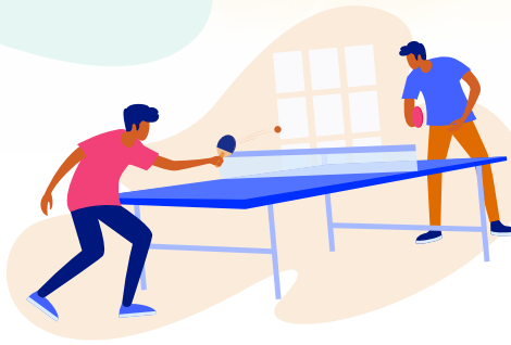
TABLE TENNIS FOR KIDS THURSDAYS 6PM / 7:45 PM

TABLE TENNIS FOR ADULTS (FREE PLAY) WEDNESDAYS 7:45 PM